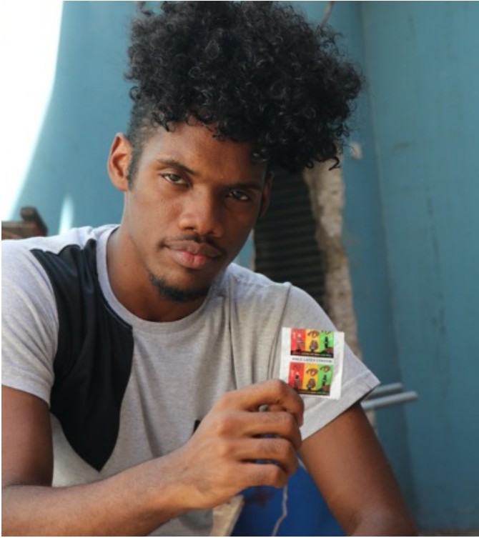
Peer outreach worker.

created through TABS and iFLEX was dedicated to reaching and providing risk-reduction interventions, edutainment, and HIV services to potential clients. These organizations had dedicated online staff who engaged with new clients on social media and dating apps and supported their uptake of HIV services offline.