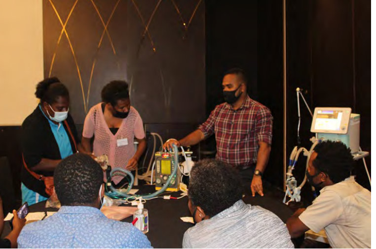
Health workers in PNG participate in a practical session on how to use the USG-donated ZOLL ventilator.

EpiC supported the installation and use of 21 of the 40 donated ventilators during the project's implementation period. The NDoH Health Facility Branch deployed the remaining ventilators. Supervision reports showed that by the end of the activity, 11 out of the 17 health facilities targeted for support were managing patients on ventilators. The remaining six facilities either did not have ventilators, were referring patients requiring breathing support to other facilities, or had not received any