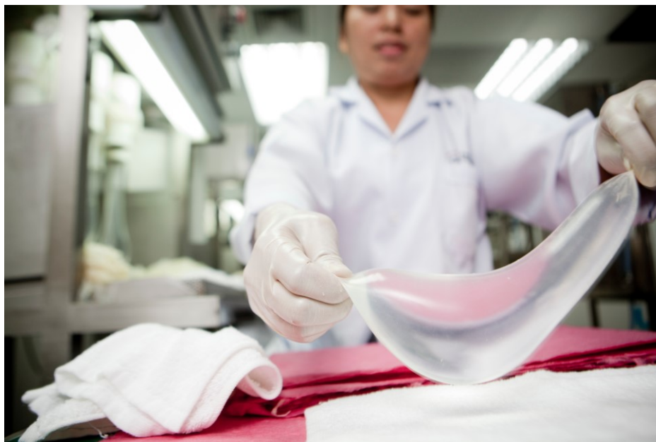
Jessica Scranton/FHI 360

Product quality and compliance at FHI 360 is dedicated to ensuring that global health commodities comply with international standards for quality, safety, and efficacy, and perform per manufacturer claims. Established in 1989, the product quality and compliance (PQC) department provides comprehensive quality assurance and quality control services for a wide range of global health products. With laboratories in Durham, North Carolina and Bangkok, Thailand that are both accredited to International Organization for Standardization (ISO) 17025 1 and more than 45 staff, we work for government agencies, multilateral organizations, nongovernmental and development organizations, and the private industry.