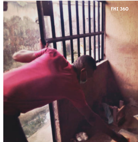
» A staff member leaves a package of ARVs on a client's doorstep to adhere to social distancing guidelines.

People dispensing ART at private facilities or making home deliveries should wear PPE and follow other preventive measures, such as physical distancing and hand washing.