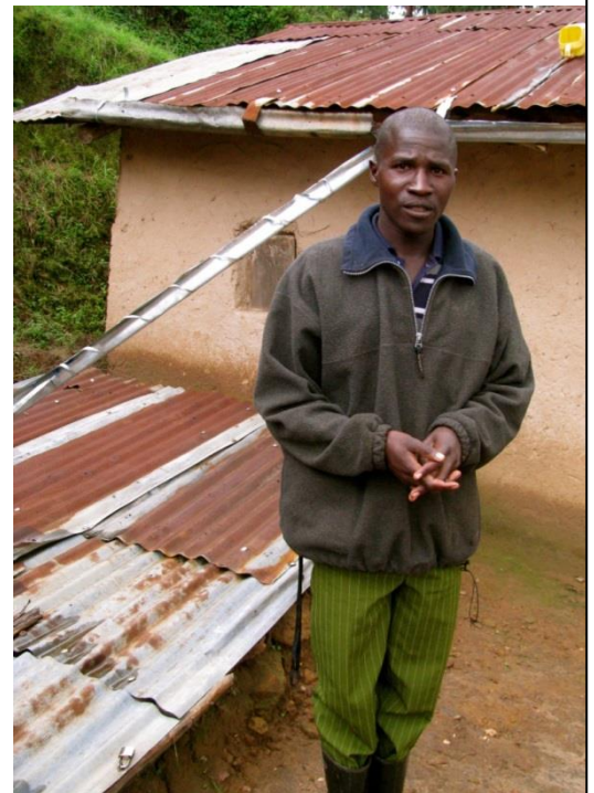
Ugandan householder makes a ‘do it yourself’ rainwater catchment system