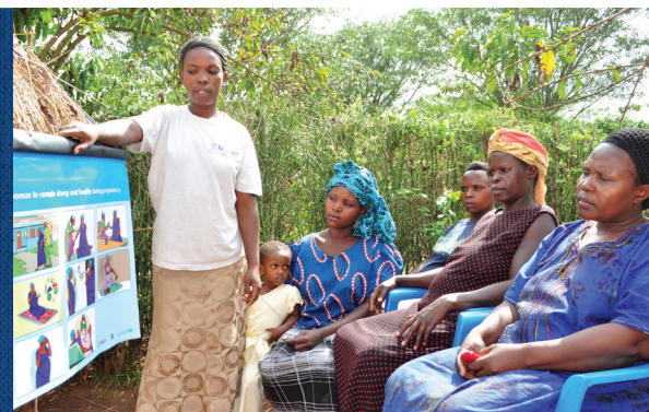
Family Life School in Ikumba, Kabale district.

This Technical Note summarizes key findings from a learning exercise that examined the feasibility of sustainably scaling-up the USAID Uganda Community Connector Project's Family Life School approach, in an effort to provide lessons and ideas for adapting this model as a model for multisectoral interventions.