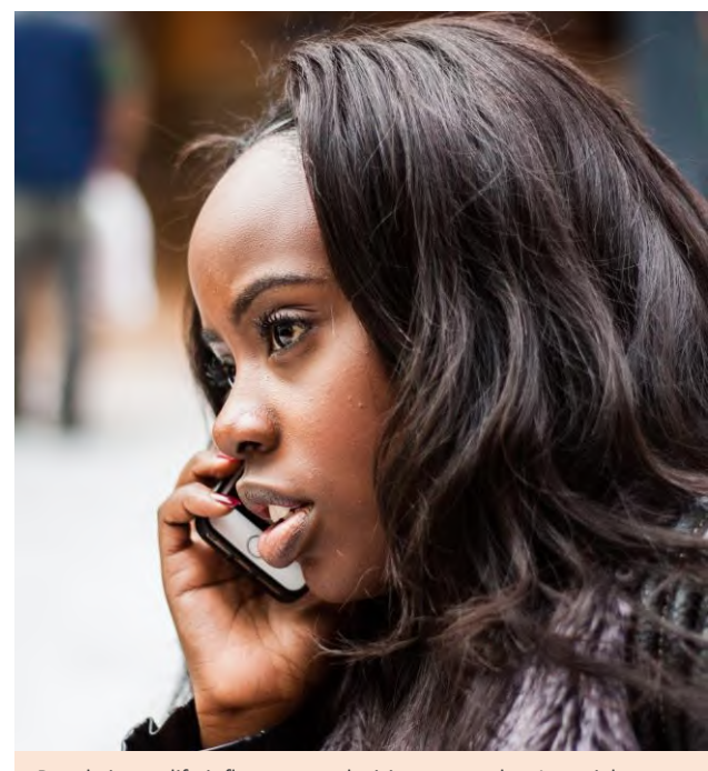
People in our life influence our decisions every day. In social network outreach, these personal connections are carefully mobilized for HIV prevention, care, and treatment.