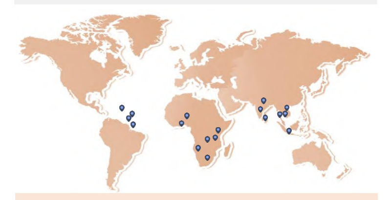
Online outreach workers were trained using LINKAGES approaches in the Caribbean (Jamaica, Barbados, Trinidad & Tobago, and Suriname), Africa (Cote d'Ivoire, Mali, Democratic Republic of Congo, Burundi, and Botswana) and Asia (India, Nepal, and Indonesia). Angola, Kenya, Thailand, Cambodia, Sri Lanka, and Vietnam plan to formalize their social network outreach approach in fiscal year 2019