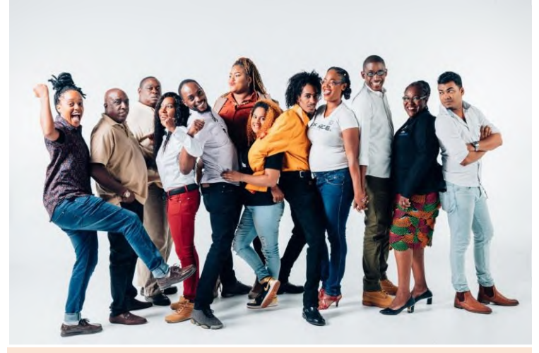
LINKAGES team of online outreach workers in Trinidad & Tobago.