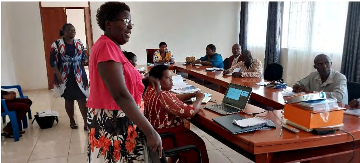
A supervisor from the MOH trains the Kamuli District Leadership and District Health Team on the COVID-19 integration plan.

EpiC also supported the MOH-Risk Communication Pillar to develop a demand generation strategy to support the COVID-19 vaccine integration process. After the plan was adopted by the MOH, EpiC rolled it out in 42 districts by training MOH national and regional master trainers on topics including effective vaccine service delivery methods and microplanning with special emphasis on mixing and matching vaccines, recording and reporting vaccine doses administered, and mobilizing the community to take up COVID-19 vaccination. Target audiences for the trainings were District Health Teams (DHTs), Regional Integrated Disease Surveillance and Response (IDSR) task force and Expanded Program on Immunization (EPI) Focal Persons and in-charges from high-volume health facilities.