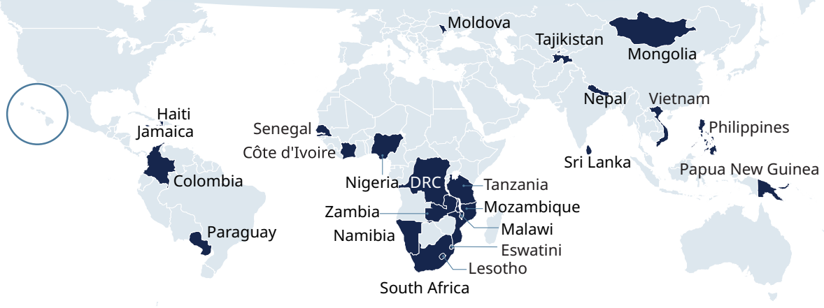
Figure 1. EpiC supports 24 countries to strengthen their oxygen ecosystems through infrastructure improvements, market shaping, procurement, and more.

USAID and other donors are making significant investments to improve the medical oxygen ecosystem in low-and middle-income countries (LMICs), which is critical to strengthen health systems to be better prepared for future public health emergencies. The EpiC project, led by FHI 360 with partners Population Services International (PSI), Palladium, and Right to Care, is working to strengthen the global oxygen ecosystem through infrastructure investment, market shaping activities, technical assistance, training, and other local initiatives in 24 countries (Figure 1). EpiC collaborates with multiple partners to implement this work, including the Clinton Health Access Initiative (CHAI) and Assist International, two global leaders in strengthening oxygen ecosystems, and other global stakeholders such as Unitaid and World Health Organization (WHO). Collaboratively with USAID, EpiC works with local ministries of health (MOHs) to strengthen their respective medical facilities to have both the infrastructure and technical expertise to expand and manage their medical oxygen systems in a safe, efficient, and cost-effective manner.