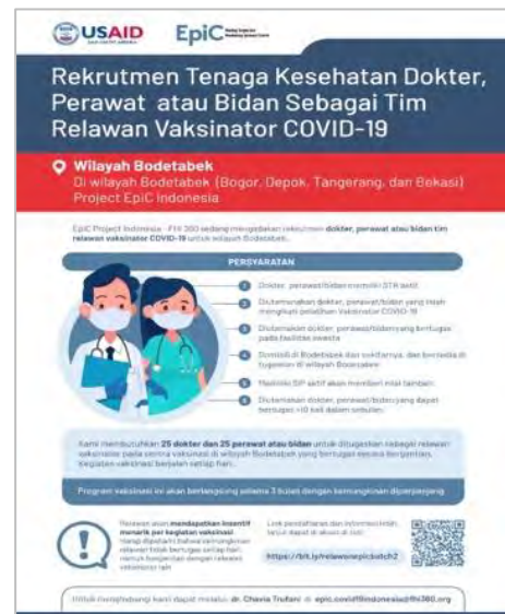
Figure 1. Social media announcement for private sector vaccinators

EpiC for COVID-19 also mobilized 2,241 data entry personnel—selected from over 2,300 applicants—to enter electronic vaccination data directly into the Government of Indonesia’s COVID-19 PCare system during vaccination events. At the district and provincial levels, 13 EpiC for COVID-19 data recording and reporting specialists assisted health authorities in Jakarta, Banten, and West Java to aggregate COVID-19 vaccination data for robust decision-making across Indonesia’s COVID-19 response.