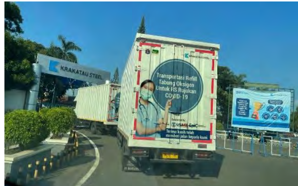
EpiC for COVID-19-supported oxygen transport services in Jakarta during the August 2021 COVID-19 surge.

Increasing oxygen availability at Jakarta hospitals. When severe shortages of oxygen threatened to overwhelm Jakarta's hospitals, EpiC for COVID-19 quickly mobilized assistance to transport oxygen cylinders to and from the Krakatau steel plant, where they could be refilled and re-distributed. In August 2021, almost 3,000 oxygen cylinders were transported, refilled, and redistributed to 40 hospitals to combat a debilitating COVID-19 surge.