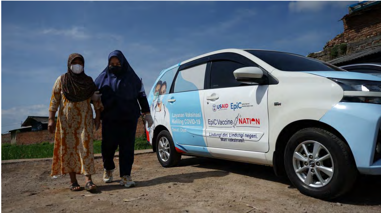
Bringing vaccines to remote communities through EpiC for COVID-19's last mile vaccination initiative.

From September 2022 to March 2023, EpiC for COVID-19 assisted the Government of Indonesia to administer a total of 99,230 last mile vaccination doses, achieving 96% of the overall target of 102,934. EpiC for COVID-19 helped nine of 11 targeted districts to exceed 70% first dose vaccination coverage among the general population and supported three of these districts to exceed 70% last dose vaccination coverage among the general population. Notably, in the pivotal elderly demographic, seven districts attained the 70% benchmark for first dose vaccination coverage among individuals aged 60 or more, while three districts achieved 70% last dose vaccination coverage.