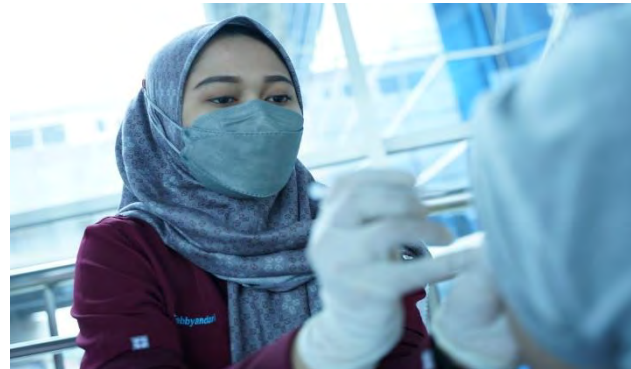
Vaccinating train commuters, in collaboration with Commuter Train Indonesia.

EpiC for COVID-19 vaccination acceleration activities took place from August 2021 to March 2022, beginning in Jakarta, Banten, and West Java and expanding to Central Java and the Special Region of Yogyakarta. Across 36 targeted districts, 2,853 vaccination sites were established at health facilities, places of worship, schools, malls, villages, and other community spaces. Mobile vaccination vans were deployed hundreds of times to conduct mobile and door-to-door vaccinations, and to transport vulnerable individuals—such as the elderly and people with disabilities—to and from COVID-19 vaccination sites.