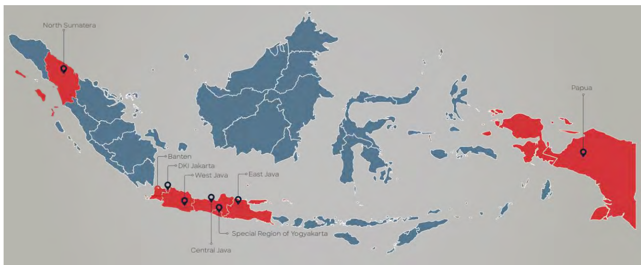
Figure 3. Vaccination coverage areas highlighted in red.

Unlike the vaccination acceleration phase, last mile vaccination coverage began slowly as EpiC for COVID-19 negotiated program approvals, navigated vaccine commodity stock-outs, and conducted intensive door-to-door vaccination demand creation. The project recruited and trained 84 health care workers, 52 data entry personnel, and 11 health cadres to promote vaccinations, administer doses, and/or record vaccination events. Twenty field coordinators were mobilized to support vaccine delivery preparation and coordination efforts at sub-district levels, while three recording and reporting specialists strengthened COVID-19 data recording and reporting at provincial levels.