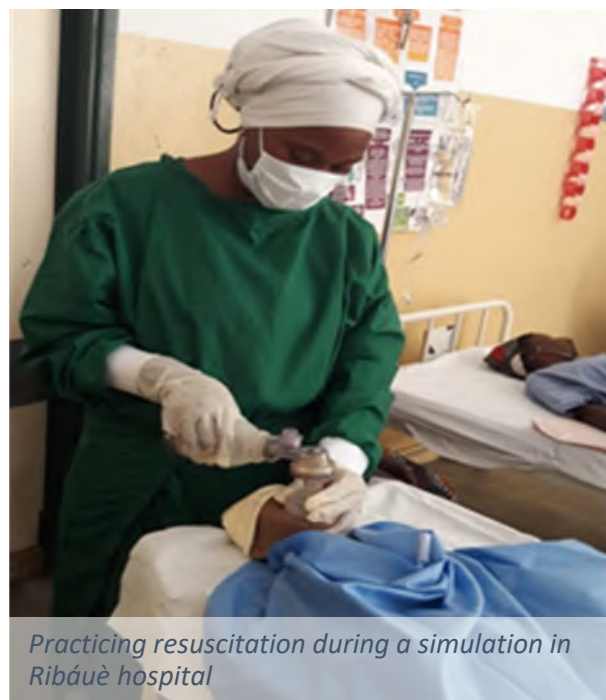
Practicing resuscitation during a simulation in Ribáuè hospital

Silêncio Francisco sfrancisco@fhi360.org