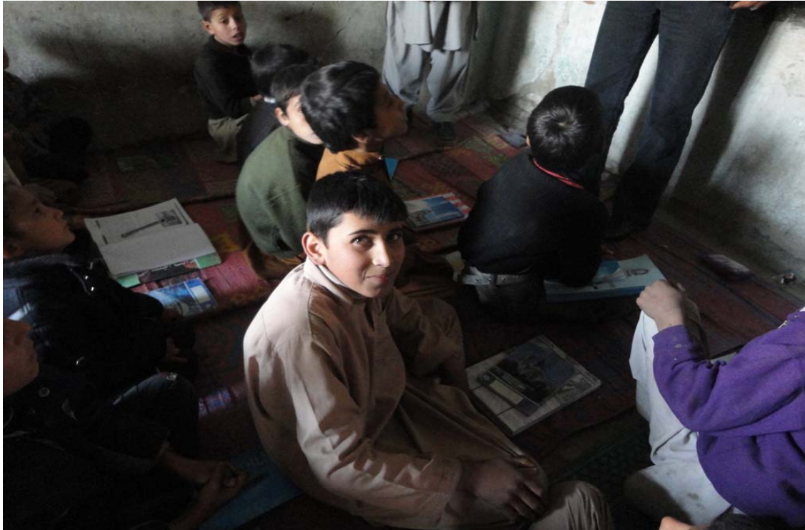
Apprentices attend a supplementary education class offered by ASF

The ASF experience is a strong example of the challenges of working in conflict-affected environments. Economic activity is essential to social recovery in these contexts, but donor dependence, weak business support infrastructure, and social and political volatility substantially complicate activities.