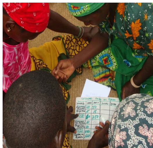
Women learn farming business practices through STRIVE Mozambique.

STRIVE Mozambique mobilized and trained VSL groups in