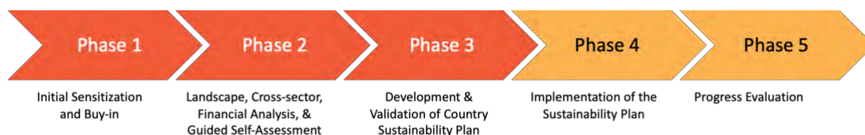
Figure 1 Sustainability approach supported by USAID in West Africa

Figure 1 illustrates the multi-phased approach, supported by Act to End NTDs | West, that promotes multisectoral coordination to advance NTD sustainability milestones. The process is adapted to each country's specific needs and objectives and identifies context-specific priorities and timelines. In Phase 1 , the NTDPs engage intra- and inter-sectoral stakeholders through sensitization meetings and illustrate the range of benefits gained from the elimination and control of NTDs to garner buy-in and support in the fight against NTDs. Phase 2 involves select assessments that identify key cross-sector stakeholders, barriers, and opportunities for strengthened coordination with potential and existing NTDP stakeholders. Phase 3 actively prioritizes sustainability services by developing a formal Sustainability Plan while simultaneously formalizing and launching multisectoral coordination mechanisms and their action plans. Phase 4 is the implementation of the Sustainability Plan, which is evaluated and reiterated throughout Phase 5 and relies on the active participation of health and non-health sector stakeholders. Drawing from practical experiences and insights drawn throughout these phases, the following sections will highlight how NTDPs mobilize and engage key stakeholders across sectors to coordinate and integrate NTD services within the broader health system, resulting in public health and socioeconomic gains.