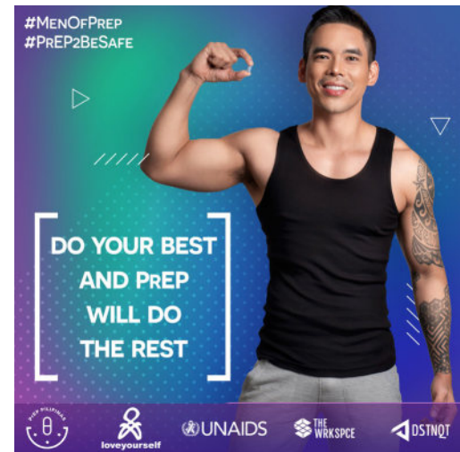
LoveYourself's Men of PrEP Facebook online demand creation

To facilitate strategic PrEP implementation, in late 2023, EpiC supported the DOH to set national-level targets for the number of people the DOH planned to initiate and retain on PrEP. Site-level targets were then set and disseminated to sites based on KP size estimates, testing coverage, and current PrEP coverage. This ensures both the contribution of each site to national achievement of PrEP coverage and the provision of PrEP services to the immediate communities served by EpiC partners. The site-level targets also serve as the basis for the allocation of PrEP and HIV testing commodities, as well as for the conduct of online and on-site activities to promote PrEP.