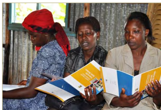
Community health workers use WASHplus materials during a training program on integrating WASH into HIV care and inclusive sanitation.

To test the small doable action approach, WASHplus piloted a complete integration of WASH-HIV activities in three subcounties representing agrarian, urban, and nomadic communities. Baseline data were collected in 3,286 interviews from intervention and control sites in 2013. Data collected provided some insights into the challenges of changing WASH practices in Kenya. Nomadic populations and to some extent rural areas still practice open defecation. Urban areas share latrines, which are considered by the UN's Joint Monitoring Programme to be unimproved. Most households do not have fixed hand washing stations, and only half of those with hand washing stations have soap and water present. Opportunities to improve water treatment practices also exist. Finally, semi-nomadic populations are the most in need and the hardest to reach.