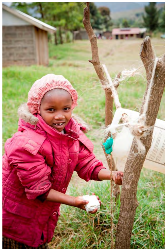
One WASHplus small doable action promoted to curb diarrhea was providing hand washing stations, like this tippy tap, near household latrines.

A growing body of evidence indicates that preventable diseases such as diarrhea have a profoundly negative impact on the effectiveness of antiretroviral treatments and the quality of life for PLHIV. People and households affected by HIV and AIDS have a substantially greater need for WASH services—more water, safe water, easy access to water and sanitation, and proper hygiene. Diarrhea prevention begins at home with improved WASH practices, including safe feces disposal, water treatment, and effective hand washing at