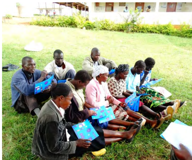
CHWs and natural leaders will soon be able to advise their clients on the most suitable latrine options given their environmental conditions using the simple latrine options job aid, a collaborative effort of WASHplus and partners that is being piloted.

As of June 2014 WASHplus, together with the MOH, had trained over 650 trainers (government and NGO actors) in WASH-HIV integration at policy and implementation levels in 26 of 47 counties. More than 8,029 CHWs in charge of at least 400 community units have been trained on WASH-HIV integration and inclusive sanitation. It is estimated that over 1.6 million Kenyans have been reached with inclusive sanitation messages. WASHplus has also introduced WASH-HIV integration strategies and activities into government policy documents and guidelines.