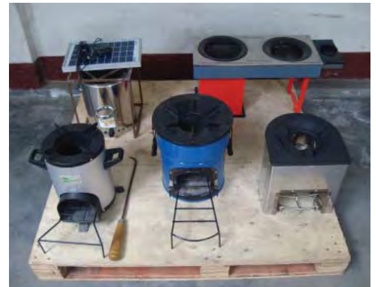
The improved cookstoves used in the Phase One trial, clockwise from top left: Eco-Chula, Prakti, Envirofit, EcoZoom, and Greenway.

ICS fuel efficiency was measured using a three-day kitchen performance test (KPT), widely acknowledged as the best currently available method for accurately estimating daily household fuel consumption. The KPT was carried out using a cross-sectional study design in 116 study households and 24 control households. Two approaches were used to measure the