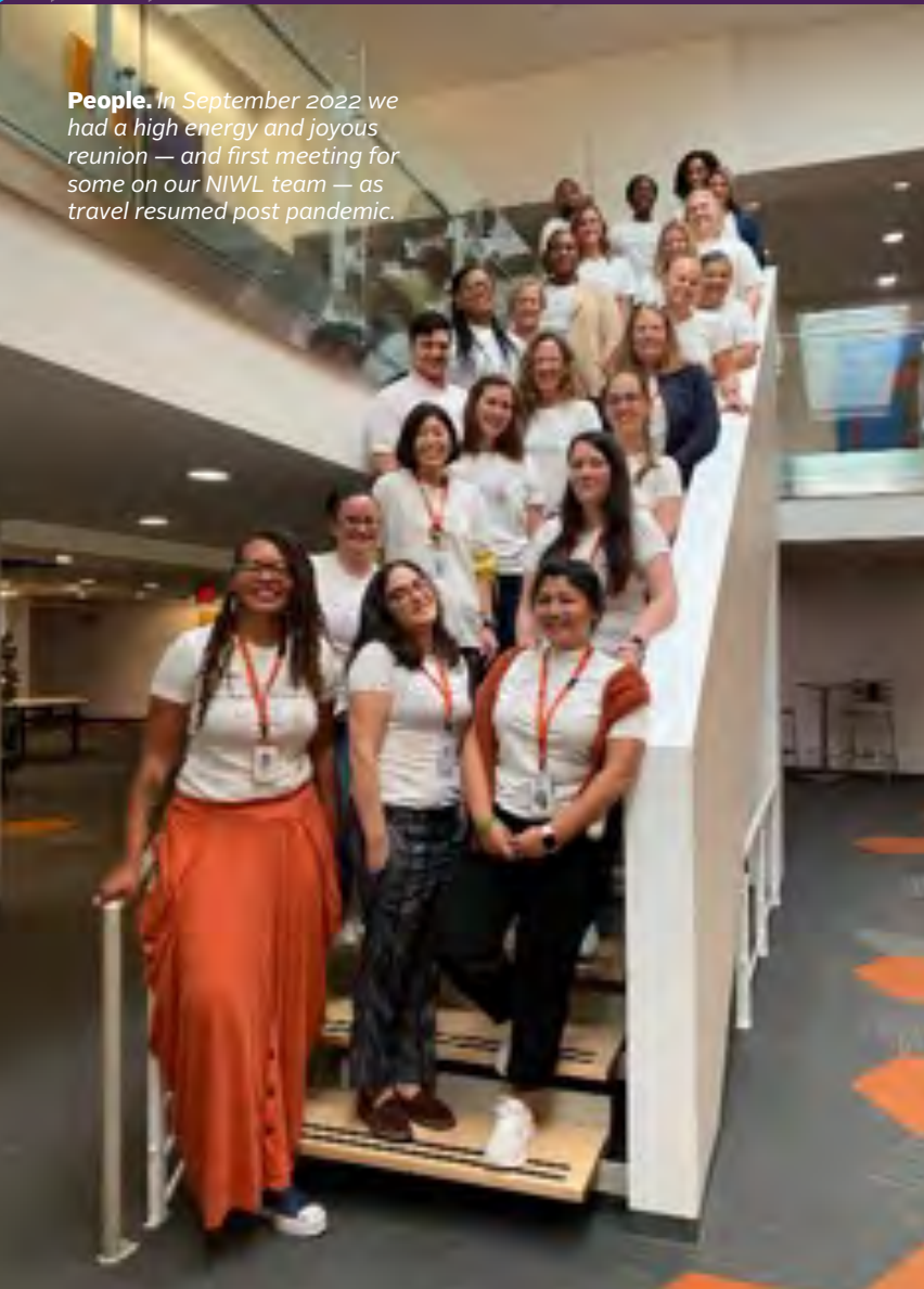
People. In September 2022 we had a high energy and joyous reunion — and first meeting for some on our NIWL team — as travel resumed post pandemic.