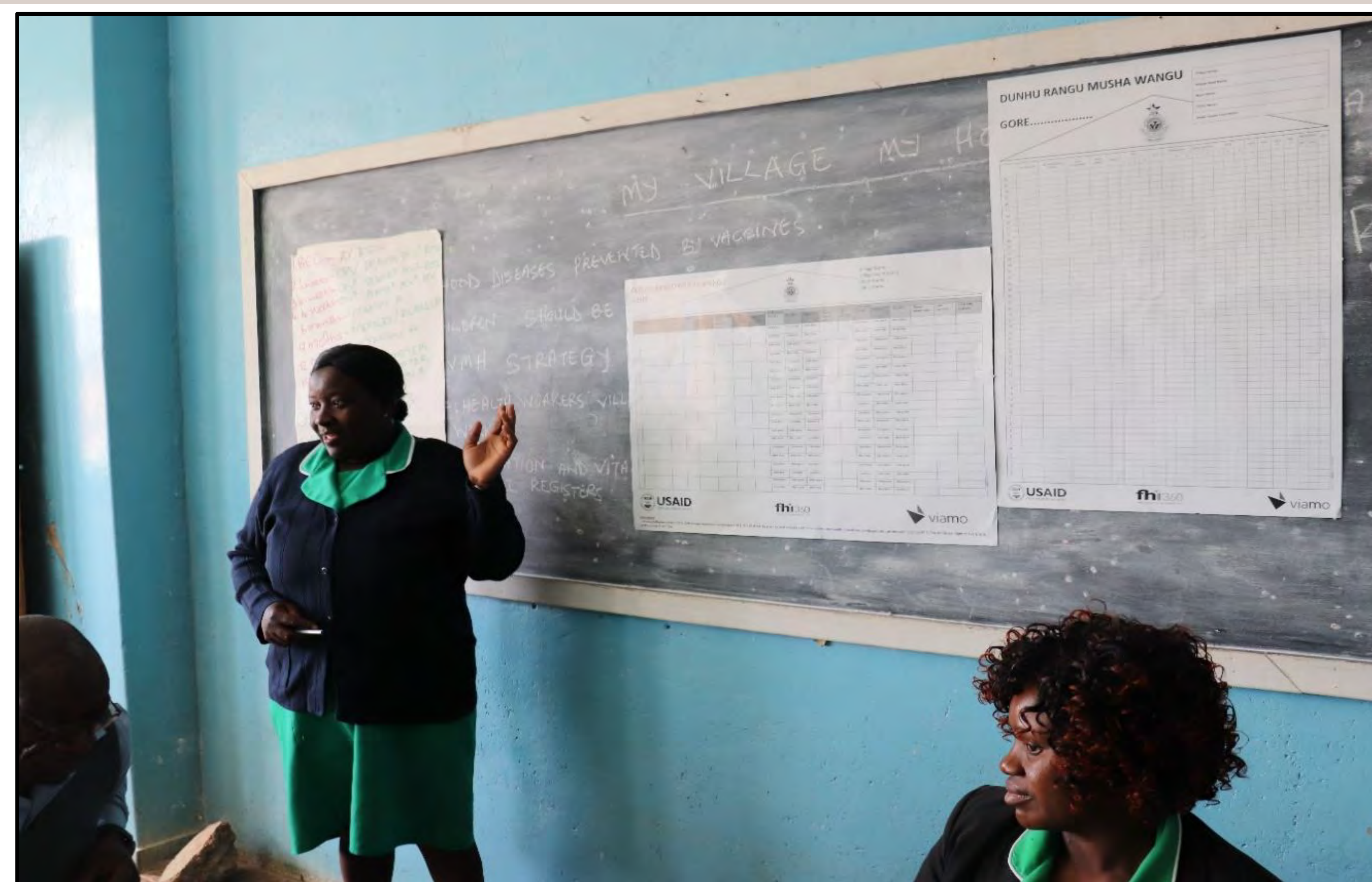
Nursing staff train VHWs on MVMH in Mutambara