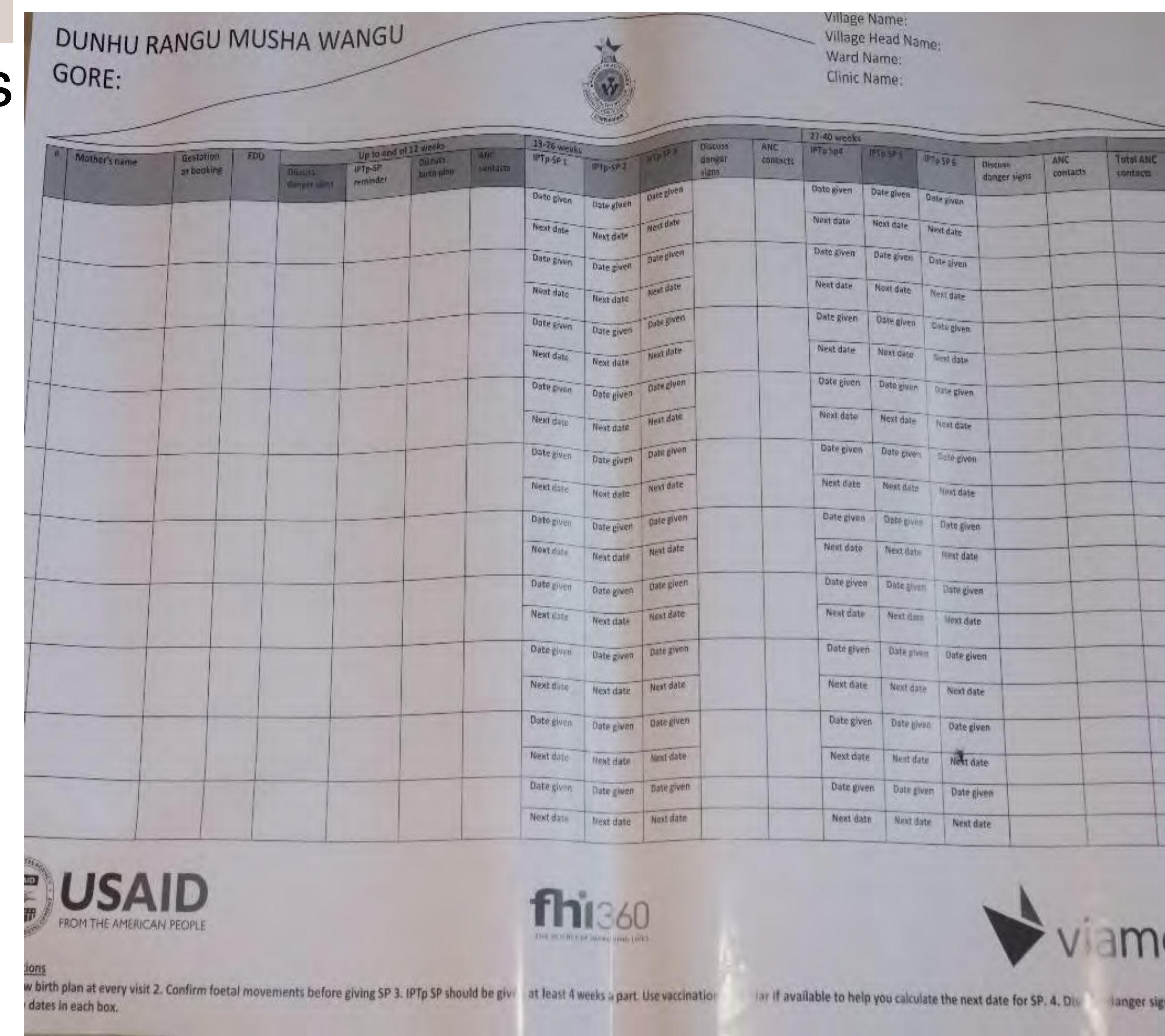
MVMH maternal health chart

VHWs with support from village heads use a pregnancy surveillance chart in communities to register pregnant women and follow them up to ensure they receive ANC contacts and IPTp doses according to the new ANC guideline, in addition to tracking children's immunization status