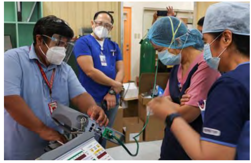
Health care workers are trained on mechanical ventilator use and COVID-19 clinical treatment.

From December 2020 to February 2021, through a blended learning approach, EpiC trained more than 500 doctors, nurses, respiratory therapists, and allied health professionals on core theories and their practical applications in key clinical areas. These concepts included personal protective equipment (PPE) basics, ICU communications, approach to hypoxemia, highflow noninvasive oxygen delivery, airway and ventilator