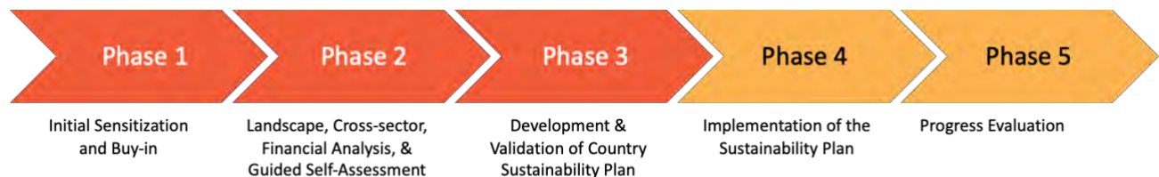
Figure 1 Sustainability approach supported by USAID in West Africa

Successful advocacy is built from compelling arguments with strong, accompanying data for the designated audience targeted for commitment to the cause. It requires an agreed-upon accountability mechanism for implementation and enforcement over time. NTDPs’ advocacy activities should respond to governments’ NTD priorities and help promote collaborative interventions to reduce health inequity.