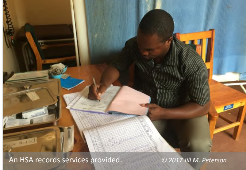
An HSA records services provided.