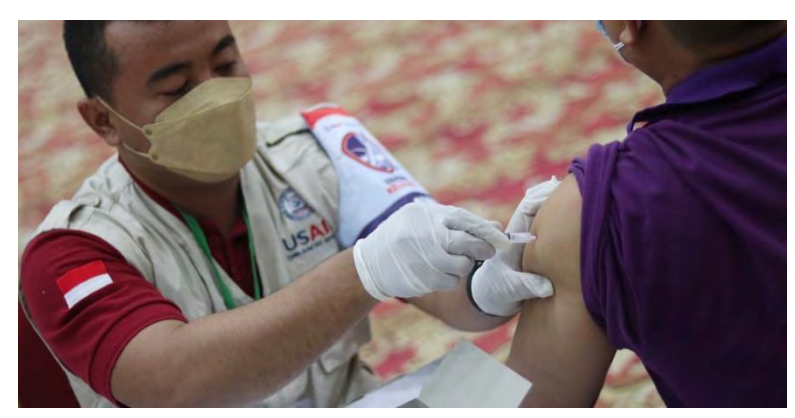
EpiC mobilized over 3,200 private sector doctors, nurses, and midwives as vaccinators to administer over 1.74 million doses between August 2021 and April 2022.

Islands), Nepal, Nigeria, Papua New Guinea, Tanzania, and Uganda. The project partners work with national stakeholders to jointly develop and roll out COVID-19 vaccination policies and plans, prepare frontline health workers to deliver COVID-19 vaccines, track adverse effects, and develop monitoring systems to improve vaccine delivery. To create demand, counter misinformation, and address vaccine hesitancy, EpiC leads vaccine communication campaigns and engages trusted local leaders and peers in sharing accurate information about the safety and benefits of COVID-19 vaccinations.