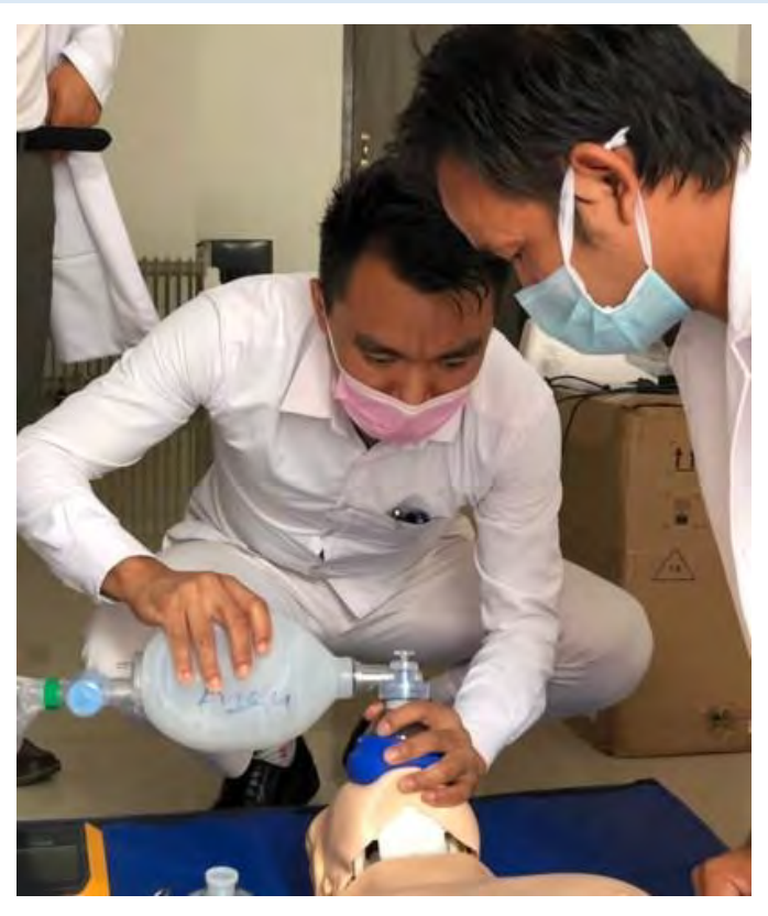
Health care workers receive training in critical care in Bhutan.

EpiC conducts in-person and remote training on triage, infection control, critical care (including oxygen therapy), and COVID-19 therapeutics for physicians, nurses, and other members of the