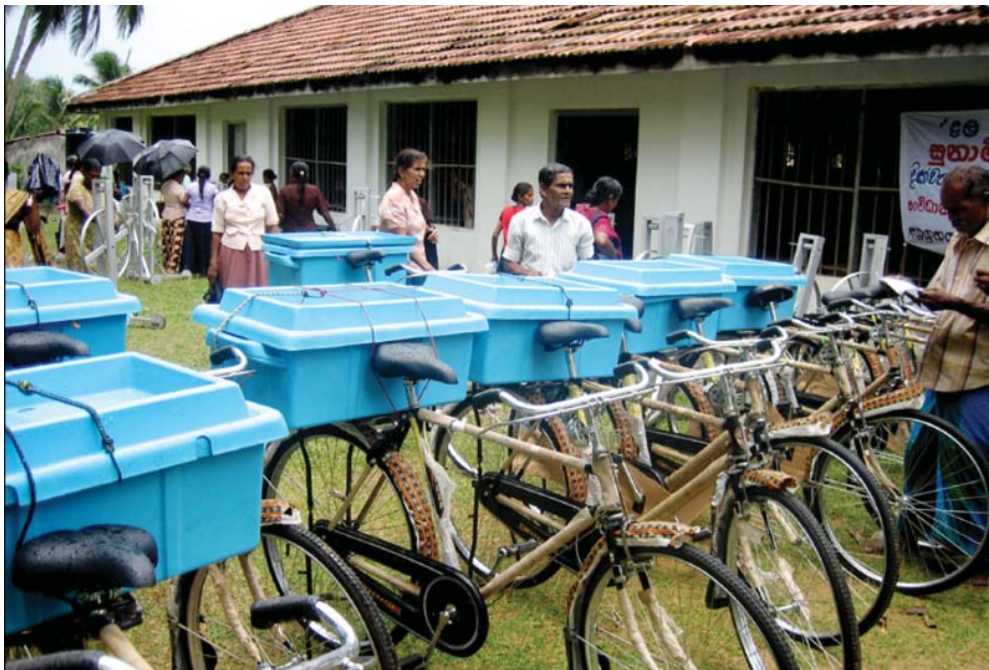
The Dikwella People's Forum presents 25 bicycles with fish containers and 75 coir rope-making machines to those who lost the tools of their livelihoods in the tsunami.

The Academy for Educational Development (AED) is raising funds to make this tool for locally driven development fully indigenous. With AED guidance in its first year, the newly formed People's Forum Federation will increase the power of the Forums to effect change on a nationwide scale. The People's Forums have the potential to transform the nation from the ground up: once their sustainability is ensured, they will be able to improve the lives of Sri Lankans for years to come.